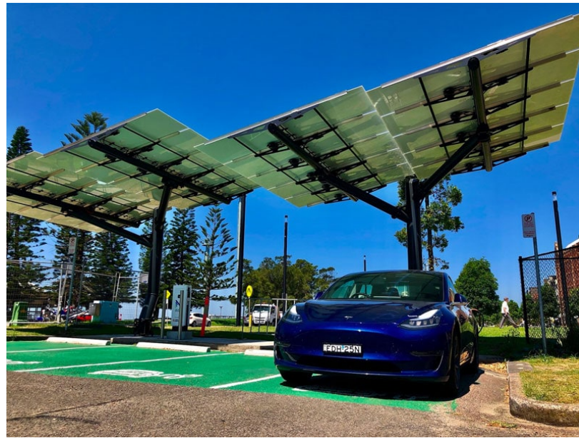
Example of shade structure with solar panels